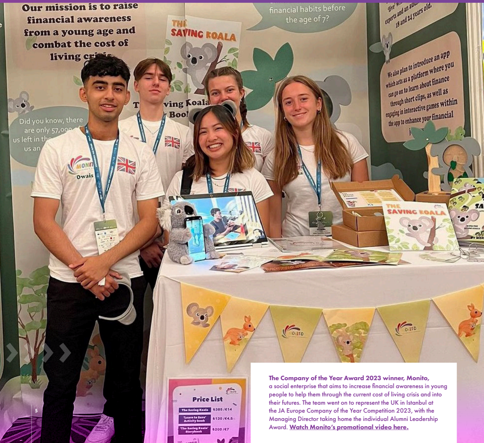
The Company of the Year Award 2023 winner, Monito, a social enterprise that aims to increase financial awareness in young people to help them through the current cost of living crisis and into their futures. The team went on to represent the UK in Istanbul at the JA Europe Company of the Year Competition 2023, with the Managing Director taking home the individual Alumni Leadership Award. Watch Monito's promotional video here.

Student companies will have opportunities to compete in competitions at a local, county, regional and national level, offering a variety of learning development opportunities including public speaking, interview skills and a chance to network with other companies locally, regionally and across the UK.