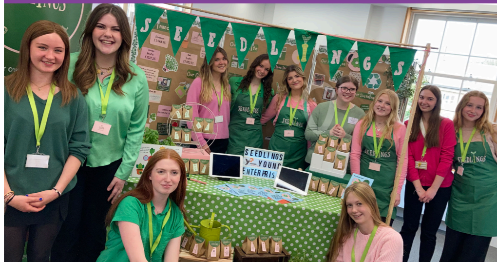
Seedlings won the Innovation & Technology award in the UK Company of the Year Awards 2023. Watch their promotional video here.

Over the year the student company will regularly meet with their volunteer who will support them to work through the eight milestones as well as helping them to prepare for the Company of the Year competitions and selling events.