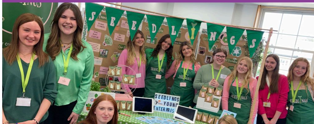
Seedlings won the Innovation & Technology award in the UK Company of the Year Awards 2023. Watch their promotional video here.

You can find further resources on supporting students with Milestones 2-8 on Company Connect .