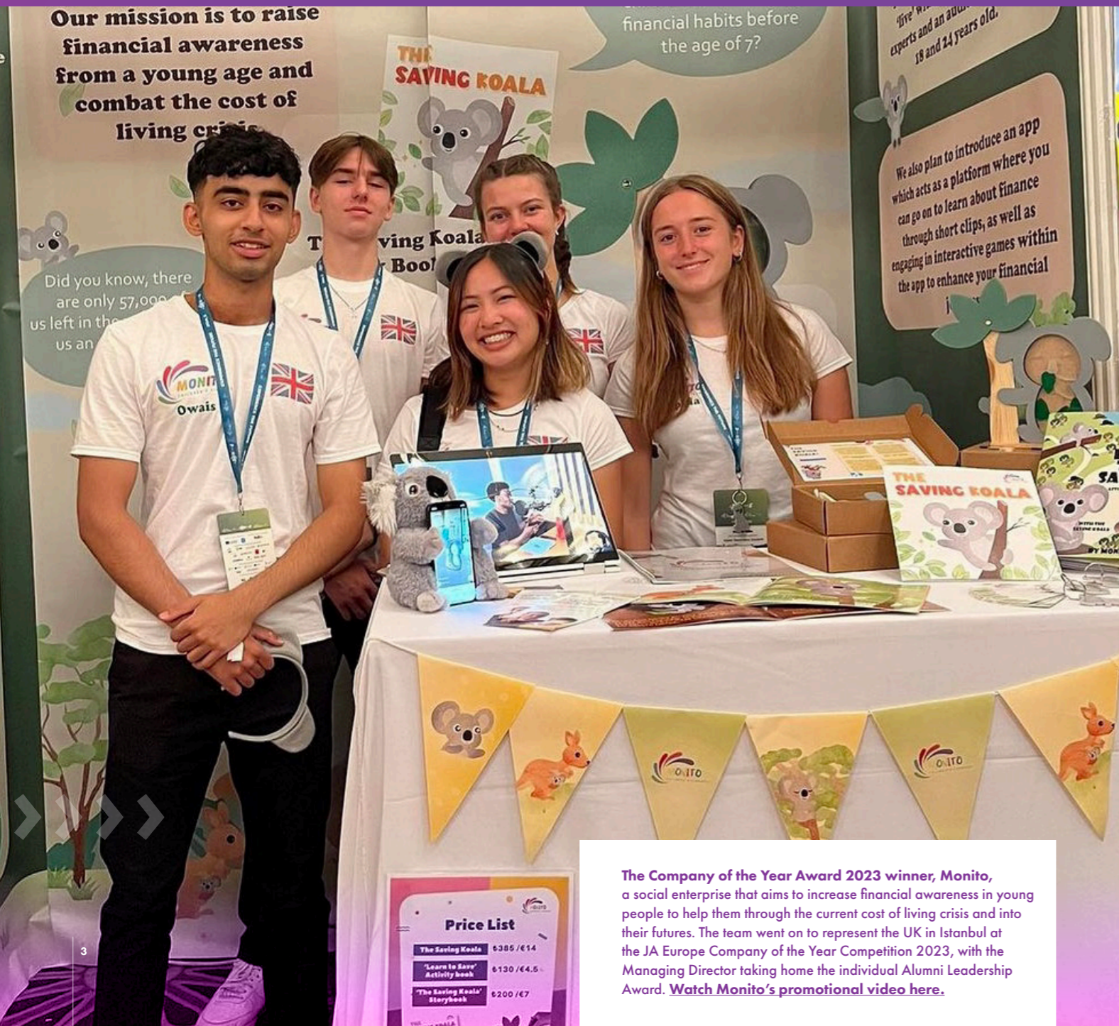
The Company of the Year Award 2023 winner, Monito, a social enterprise that aims to increase financial awareness in young people to help them through the current cost of living crisis and into their futures. The team went on to represent the UK in Istanbul at the JA Europe Company of the Year Competition 2023, with the Managing Director taking home the individual Alumni Leadership Award. Watch Monito's promotional video here.

Student companies will have opportunities to compete in competitions at a local, county, regional and national level, offering a variety of learning development opportunities including public speaking, interview skills and a chance to network with other companies locally, regionally and across the UK.